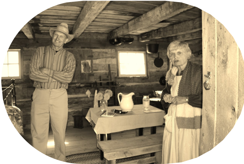
Life in the Cabin