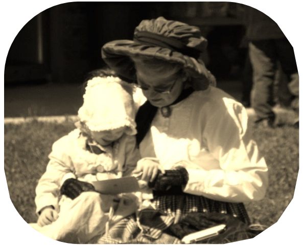
Story Time with a Modern Twist