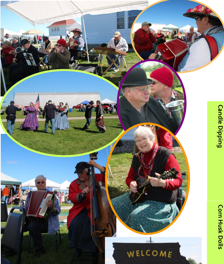
Music Enjoyed By All