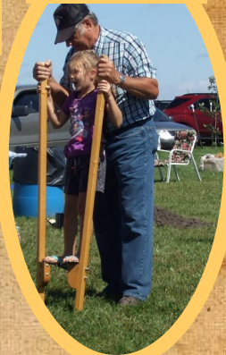
Standing Tall on Stilts