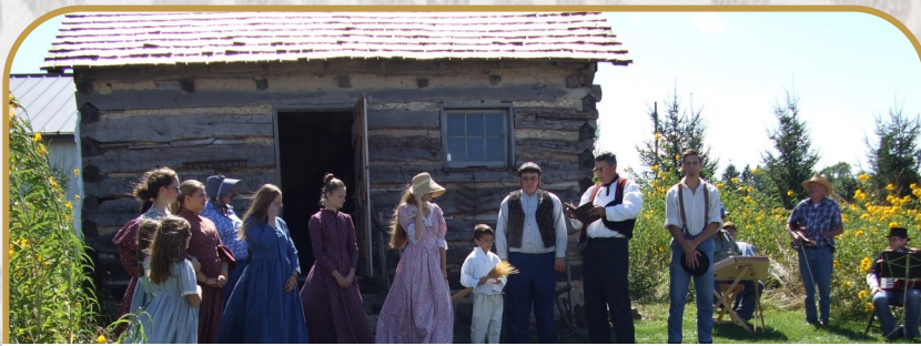
The Wedding Party

Little boys may carry the bride's train or carry sheaves of wheat as symbols of fertility.