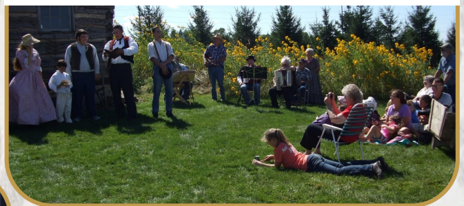
Folks Enjoying the Wedding

A pair of cedar trees is a traditional gift meant to be planted on each side of the door as a symbol of longevity.