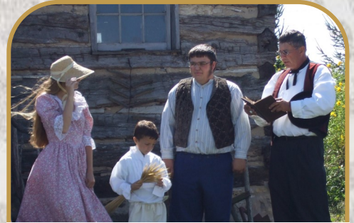
Sharing the Nuptials