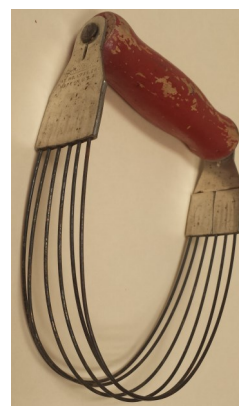
A: Pastry Cutter