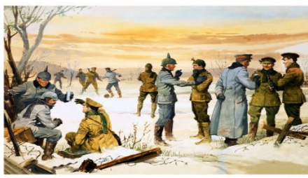
Christmas Truce 1914